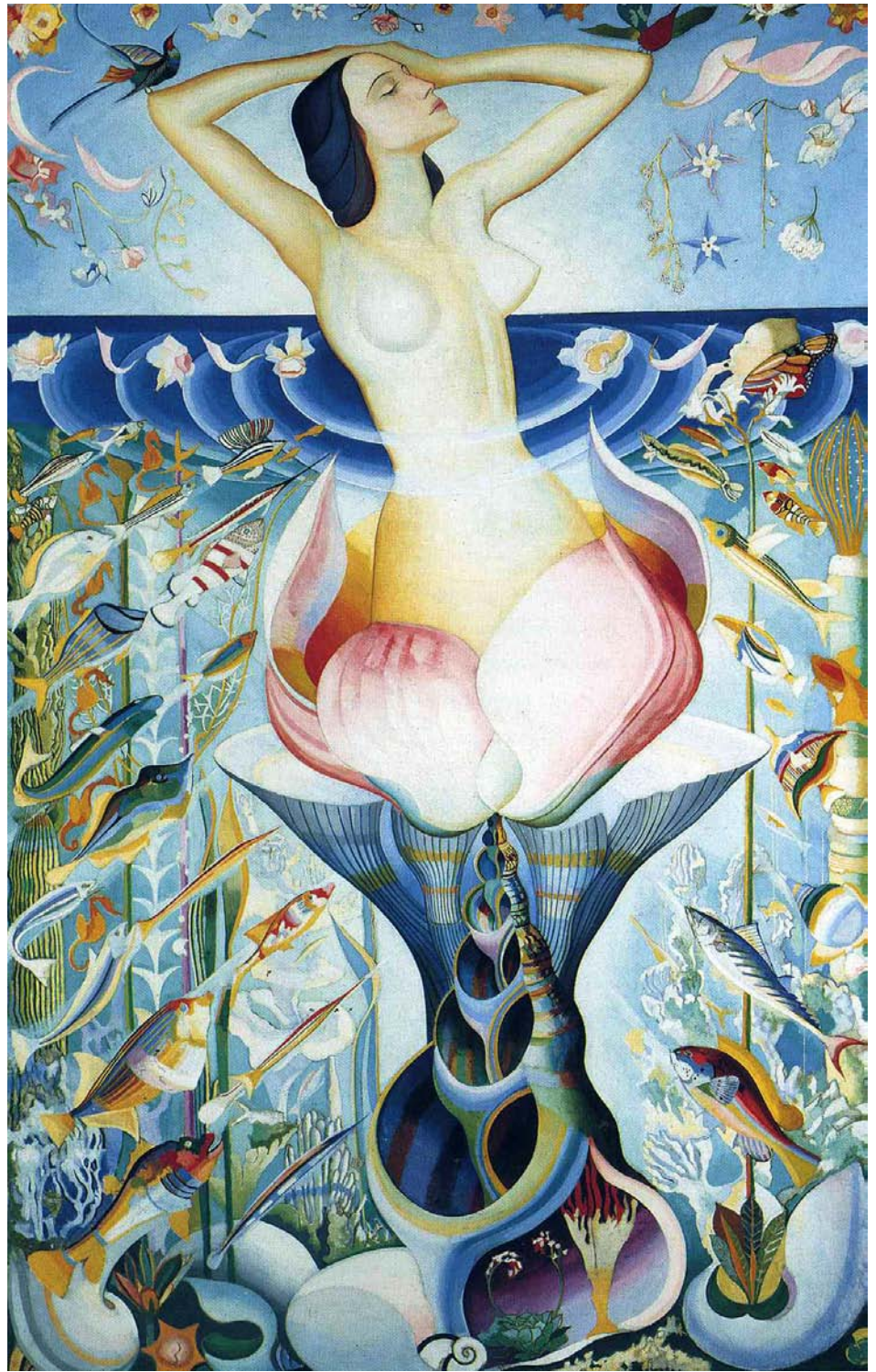
ABOVE: Birth of Venus , Joseph Stella, 1922.

It's exciting work, and I'm glad to have the chance to do my small part to turn Salisbury House into the world-class museum that I know it can and should be.